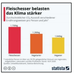
CO<sub>2</sub>-Auststoß von verschidenen Ernährungsweisen

In the EU, 88 million tonnes of food are wasted every year. This means that on average, citizens of EU countries throw away 173 kg of food each. Belgians are the second biggest culprits, each eating 345 kilos of food a year.